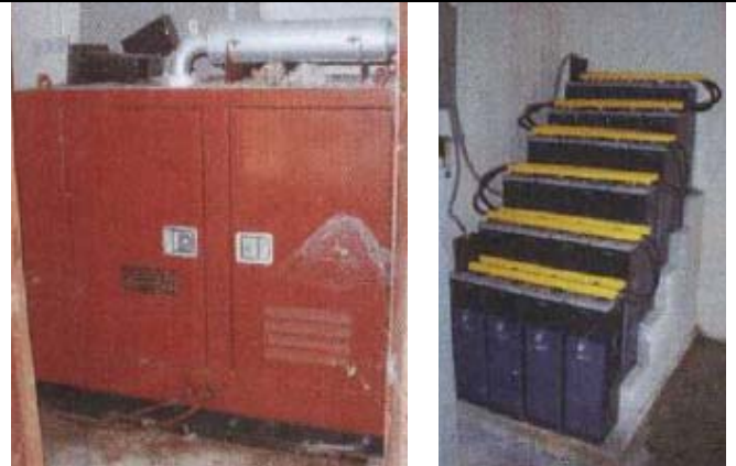
Genset and battery bank