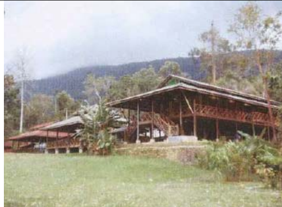
Part of the NERC complex