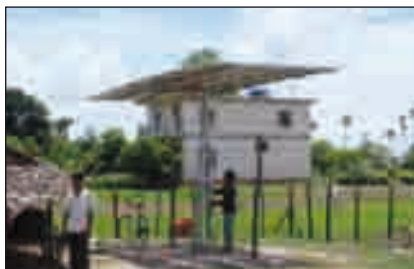
Figure 3: Cambodian mechanical operated solar tracking system

In the frame of the LOCAP UNDP Solar Battery Charging Stations Project the 4 entrepreneurs, who already operated a battery charging station got the described PV system donated. In return they are obligated to give 50 % of their daily earnings to a saving fund, whereby the other 50% are their income. Additionally, they are obligated to sell their services 40 % cheaper than diesel battery chargers (see Figure 5). The 50 % which go to the saving fund are used equally for saving, maintenance of the PV system and the work of the committee supervised by