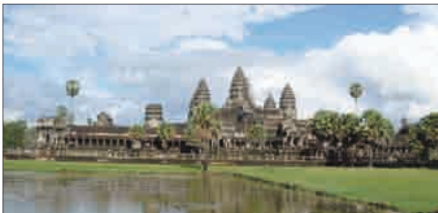
Figure 1: Angkor Wat, Siem Riep, Kambodscha

If one thinks on Cambodia the first themes springing in the mind are Ankor Wat and the Khmer Rouge. Two very important thinks in the history of the country. Whereby, Ankor Wat is a cultural heritage of which the Cambodian are very proud of, the terror regime of the Khmer Rouge was the darkest point in the history of the country. The country still struggles with the targeted killing of the intelligence of the country during the Pol-Pot regime from 1975 to 1979. Cambodia, which was before known as the Swiss of South-East-Asia is now one of the 10 poorest countries of the world. Today, one out of three Cambodians live on less than 0,5 USD a day, 27% of the population older than 15 years are illiterates and even 20% of the children are not going to the primary school. The median age is 20,6 years, with more than 50% of the population younger than 25. And this young generation, which is not