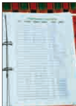
Figure 5: Battery charging and daily earning list