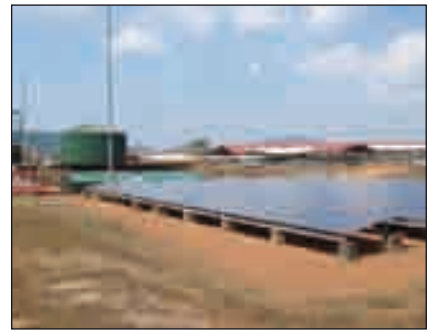
Figure 2: Hybrid 50 kWp PV and B35 kWel Biogas system, Sihanoukville Province

Anyway, their already exist some technical and financial viable projects, like the village grid of Anlong Tamey in the province Battambang, which is fed by a biomass gasifier (29 kWel) and a network of solar battery charging stations in the province of Kampong Chhnag. Both projects were funded partly by UNDP and