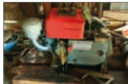
Figure 4: Home made charge controller and diesel engine

LOCAP. The so created saving fund can be used for infrastructure measurements in the community. But also secures the technical support from LOCAP to the community and the battery charging entrepreneurs even after the 12 month UNDP project phase. LOCAP developed a participatory concept which brings a win-win situation to both the entrepreneurs and the communities and additionally saves the environment.